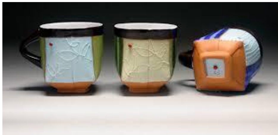
Darted/square base mugs